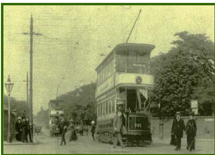
Palatine Road/Lapwing Lane looking west - 1920s

During the evening at the Northern I was introduced to a charming lady from Chorlton who told me how her dad used to take her out for weekend treats on the tram to the Palatine Road terminus at West Didsbury in the 1920s.